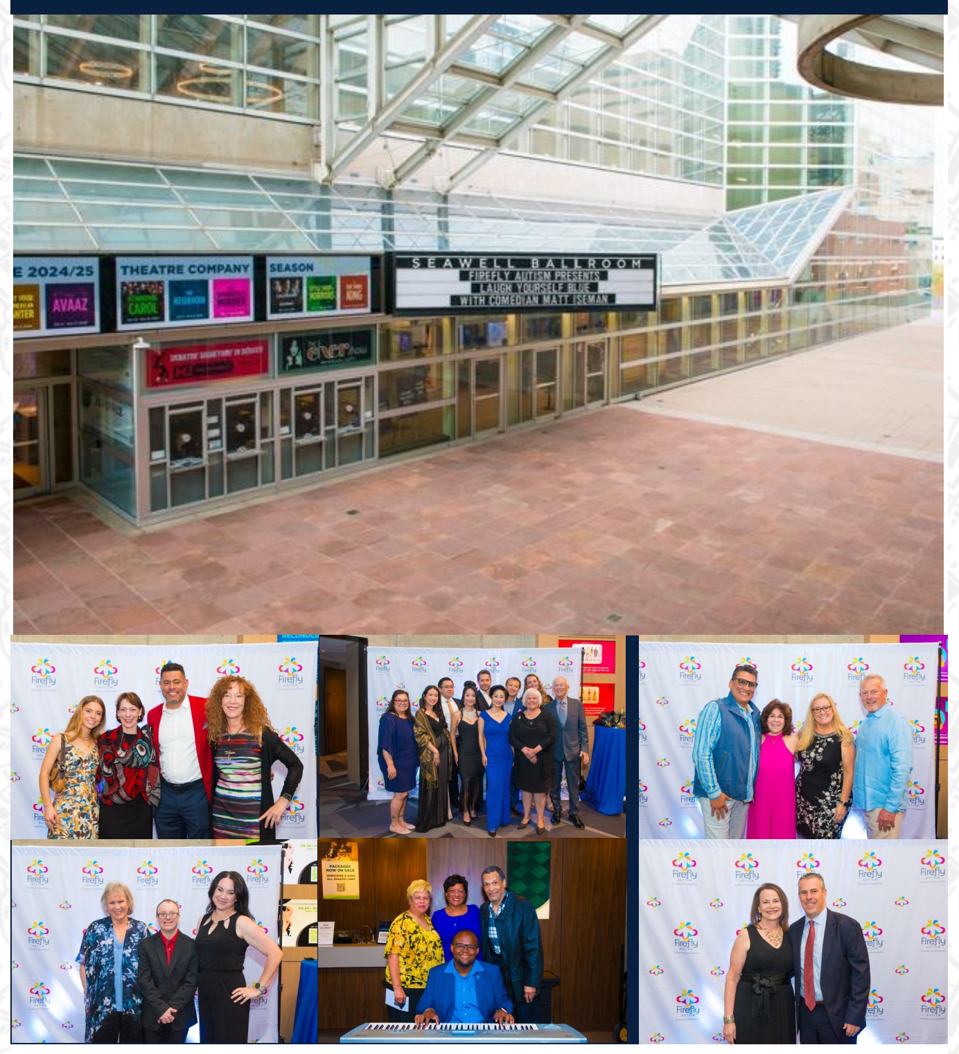
and learners. Below are a few pictures from this very special time together, and... let's do it again next year!!